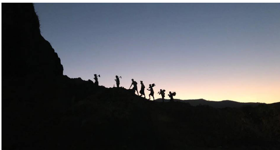
Miners at an unlicensed jade mine in Hpakant, Kachin State

associated with insecurity of tenure and strengthened investor confidence. 18 By contrast, the challenges associated with the decentralization of licensing decisions in Indonesia contributed to reduced investor interest in the country's mining sector.