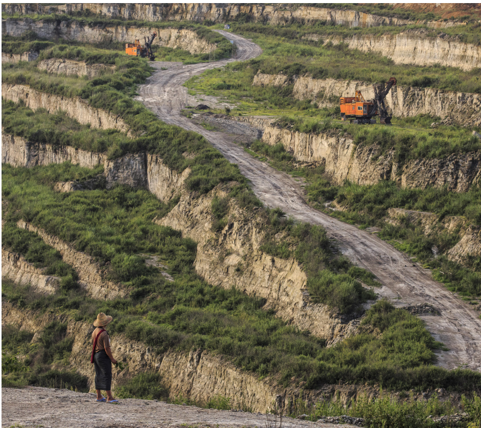
A farmer looks at the open pit of the Tigyit coal mine.

Many countries manage this risk by setting clear minimum standards at the national level but conferring implementation and monitoring responsibilities to subnational institutions. Another option is to set broad national legal standards but to allow subnational governments to supplement these with additional regulations that are tailored to the local context. For example, in Australia each state and territory has its own OSH legislation. However, in recent years the federal government has acted to improve the harmonization of laws and regulations through the development of model legislation. 15 In Indonesia, the national government legislates on local content, but individual regencies have passed additional regulations tailored to the local context. 16