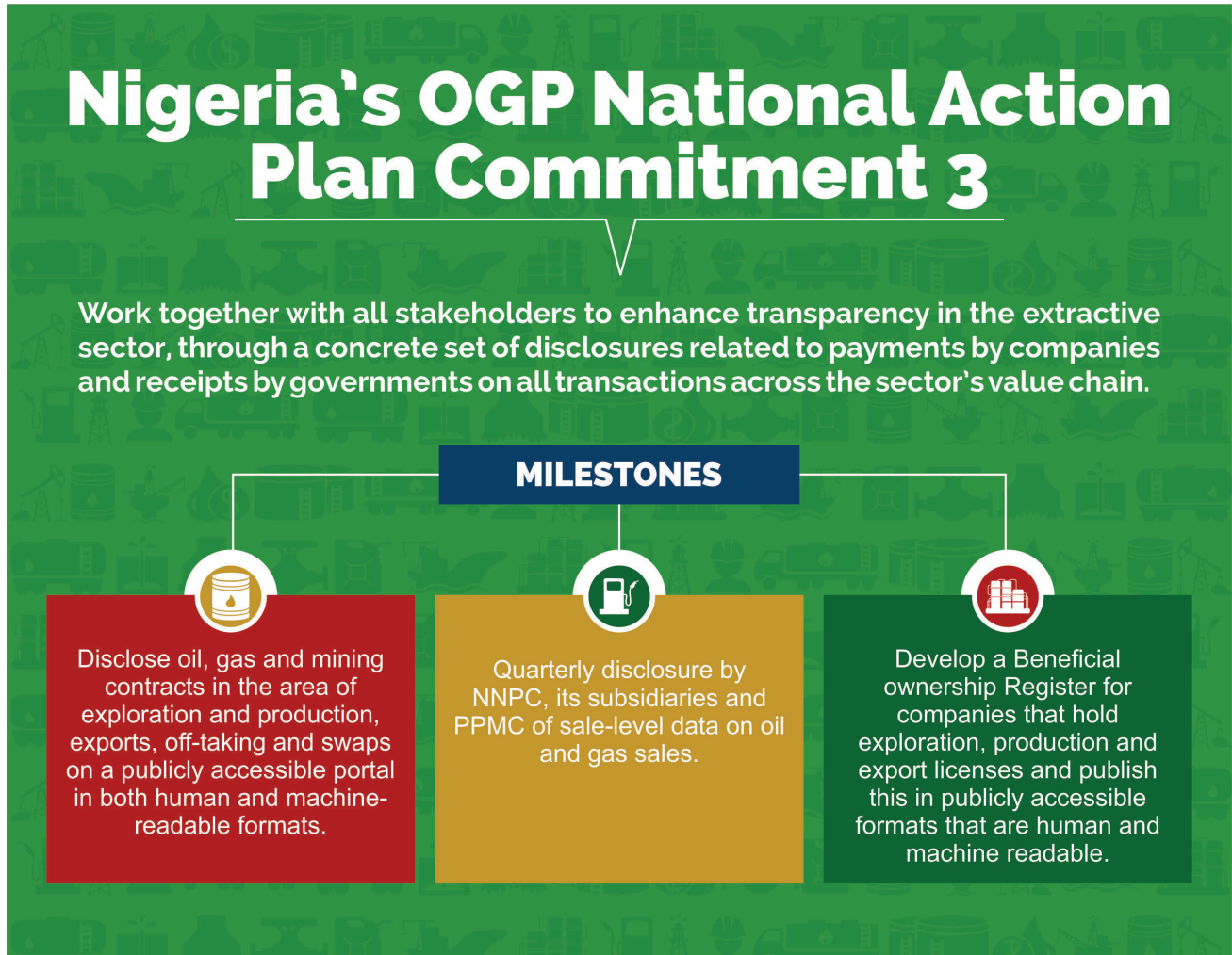
Figure 1. Nigeria's OGP National Action Plan, Commitment 3

A major purpose of Nigeria joining OGP is to bring transparency, participation and accountability to the entire value chain of the corruption-prone oil and gas sector. Though disclosures alone are insufficient, if this OGP commitment had been adhered to before, it would