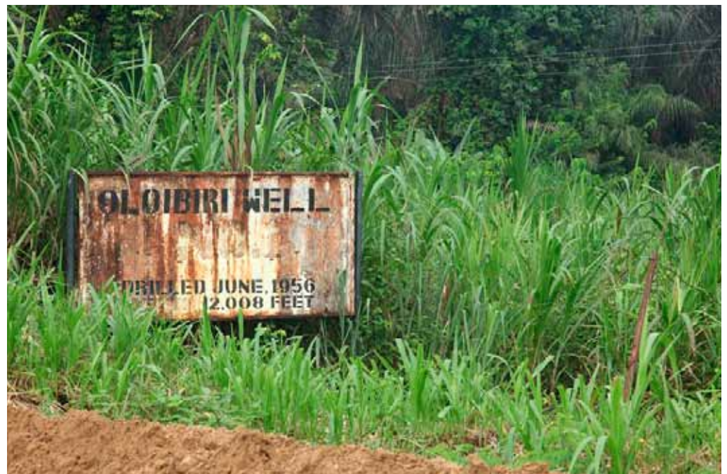
Oloibiri, where oil was first discovered in Nigeria.

Nigeria's constitution requires all states receive a share of the nation's oil revenues. The share is determined by a formula that includes an extra allowance for oil-producing states, calculated based on production volume. Largely mono-ethnic, relatively new and small in size, Bayelsa has the highest per capita revenue allocations in the country. With careful management of its share of oil revenues, the state would be in an excellent position to rapidly develop. These additional funds could help Bayelsa create critical infrastructure, increase the state savings fund and develop the non-oil economy. With an accountable and transparent governance framework and genuine political will, Bayelsa would have the potential to attract foreign investment and become a catalyst for development across the Niger Delta.