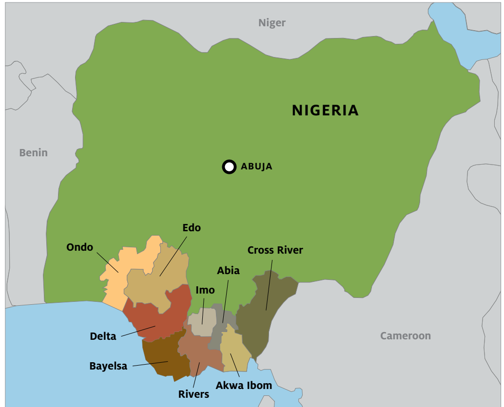
Figure 1 The Niger Delta States

In February 2008 in Dakar, Senegal, RWI organized a conference titled, “How Can Africa Get a Better Deal for its Natural Resources?” The recently elected governor of Bayelsa, Timipre Sylva, attended this workshop. During the workshop, Governor Sylva and RWI discussed establishing a subnational program that would create a mechanism for transparency and accountability, the Bayelsa Expenditure and Income Transparency Initiative (BEITI). It was clear the Governor had reformist goals for his state, and he followed up on them in March when he invited RWI to a strategy workshop on sustainable development in Bayelsa’s capital, Yenagoa. Two months later, Sylva was re-elected by an overwhelming majority. With a firm mandate for reform in place, the scene was set for RWI to partner with the Bayelsa government to assist in the creation of BEITI and to support civil society organizations to push for transparency and accountability.