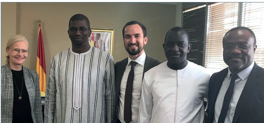
NRGi staff meet with Guinean officials to discuss improvements suggested by the Resource Governance Index

Morgan Stanley’s emerging markets bonds group has begun using the RGI to assess potential investments in resource-rich countries.