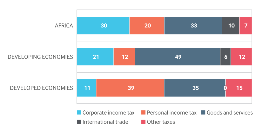
Figure 2. Composition of government tax revenue, by region (percentage)

Transfer pricing can limit income tax receipts, including in low- and middle-income countries. Developing countries depend twice as much on these receipts as developed economies, and African countries three times as much, as figure 2 shows. As developing countries try to increase funds available for social services and their national development agendas, limiting transfer mispricing is a key element of domestic resource mobilization.